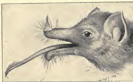
FIG. LXXI. CHÆRONYCTERIS MEXICANA. TRES MARIAS ISLANDS BAT.